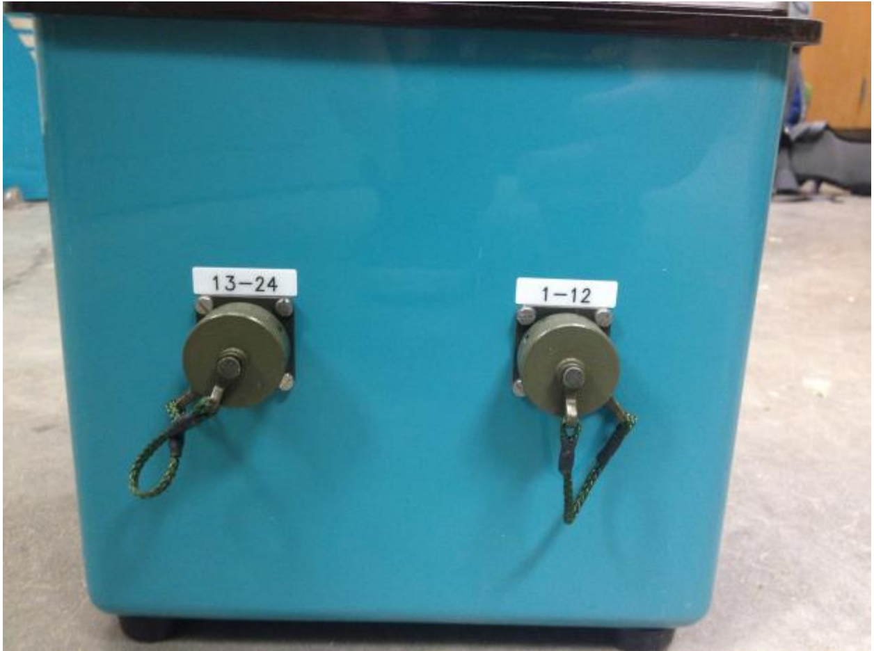
Figure 4 The switching cables for the electrodes plug into the front of the Syscal KID unit. the numbers denote which electrodes are hooked up